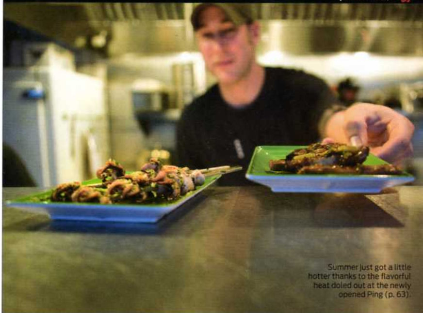
Summer just got a little hotter thanks to the flavorful heat doled out at the newly opened Ping (p. 63).